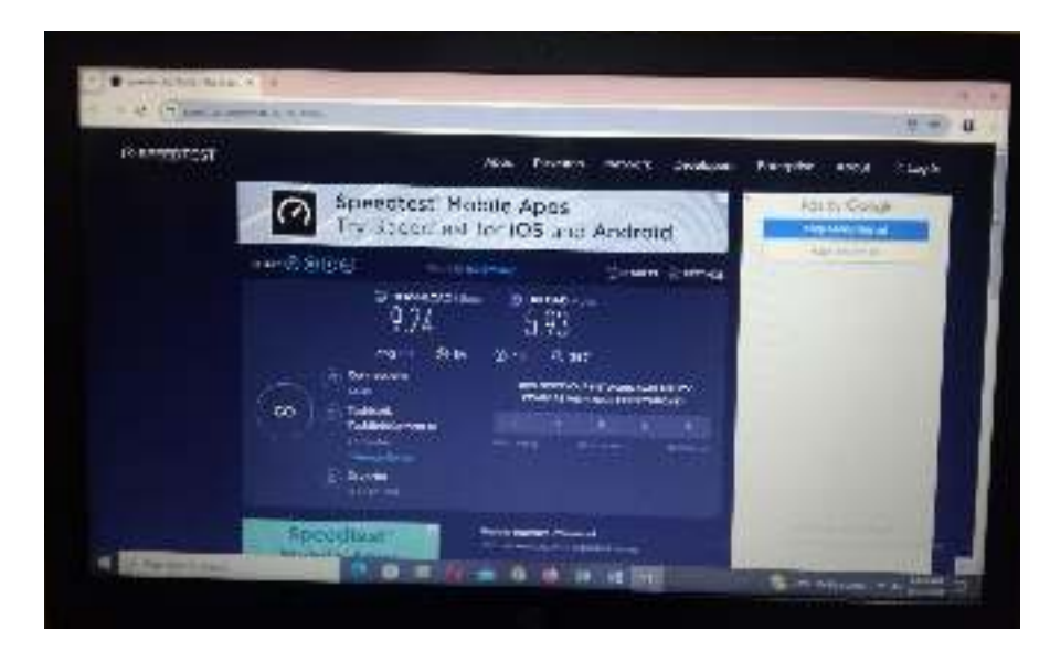
Figure 3: Speed test at the Core Router of 10Mbps.

9. The image below shows the Network setup