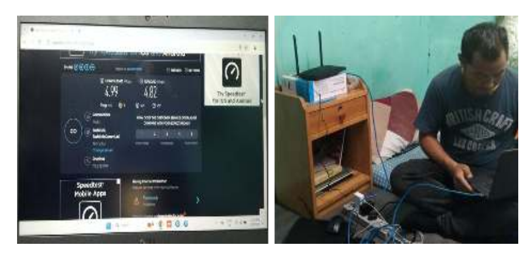
Figure 5: At the customer's house showing 5Mbps of Bandwidth.