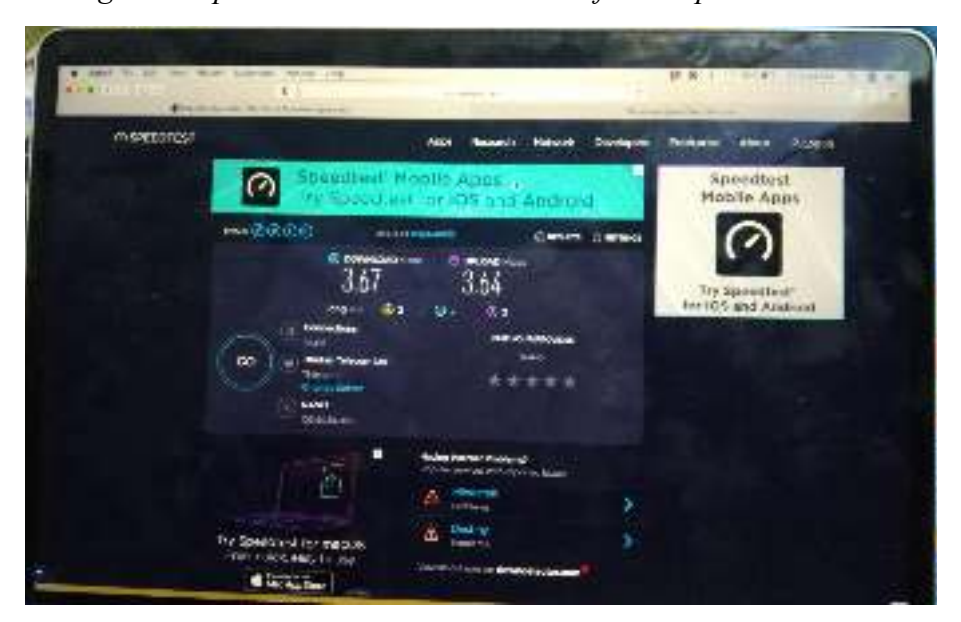
Figure 7: Speed test at User end of 4Mbps bandwidth at G&S Net.