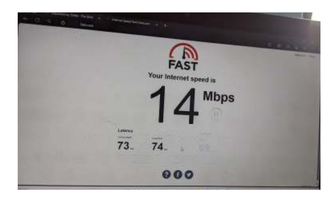
Figure 1: Speedtest of 20Mbps bandwidth connected from Bhutan Telecom Ltd for Nadlink InfoComm Ltd.

5. The image below is the Snapshot of WINBOX software used to route the IP address.